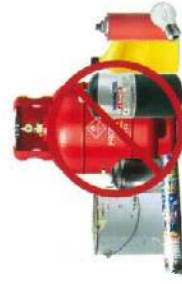
HAZARDOUS MATERIALS OR EXPLOSIVES