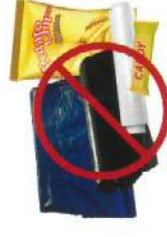
PLASTIC WRAP, FILMS, OR TARPS