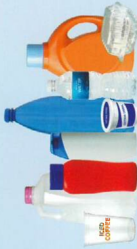
Plastic Bottles, Jugs, Tubs & Lids (Empty kitchen, laundry, & bath containers & clamshells)