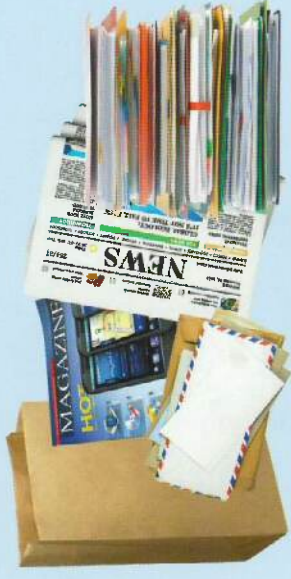
Junk Mail, Periodicals, & Office Paper (Paper bags, envelopes, & catalogs)