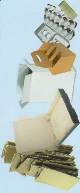
Cardboard & Boxboard (Clean & dry)