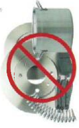
SCRAP METAL ITEMS