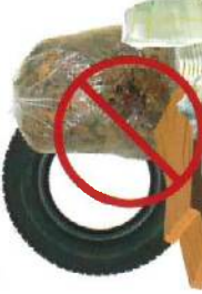
WOOD, WASTE, OR TIRES