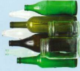
Glass Bottles & Jars (Empty food & beverage bottles & jars)