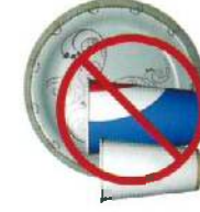
WAXY COATED PAPER ITEMS