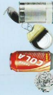
Aluminum & Steel Cans (Foil & empty food & beverage cans)