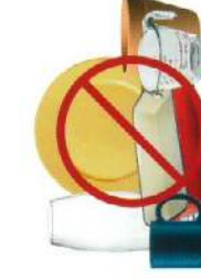
CERAMICS OR BAKING GLASS